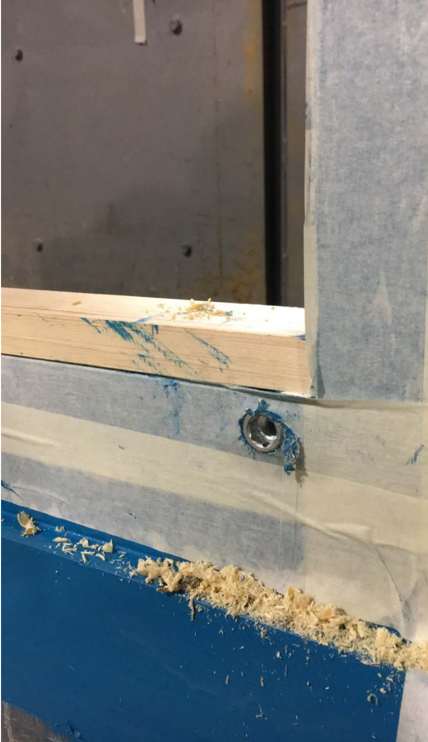
Figure 1.2: Threaded 'rivnuts' used to mount product to frame.