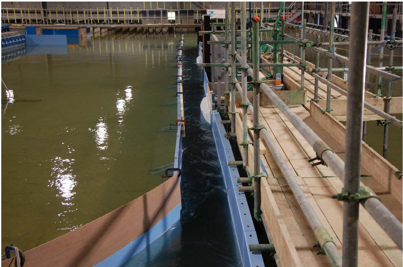
Figure 3.3: Current testing setup showing wave guide positions and flow direction.

To control the flow, guides were installed between the pump outlet and the test specimen to form a channel for the water to flow through. Several of the guides previously used to control the waves in front of the product were used to create the necessary channel in front of the product as can be seen in Figure 3.3 and Figure 3.4.