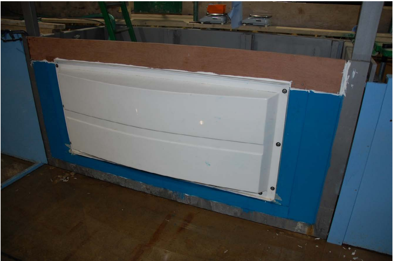
Figure 1.1: The Kayron flood barrier in the HR Wallingford test rig.

The product is an externally fitted flood barrier which was provided and fitted by Kayron. The product consists of a solid fibreglass structure fitted to the outside of the building, as shown in Figure 1.1. A number of metal screws attach the product over the building aperture and fitting into several previously inserted threaded 'rivnuts' as shown in Figure 1.2