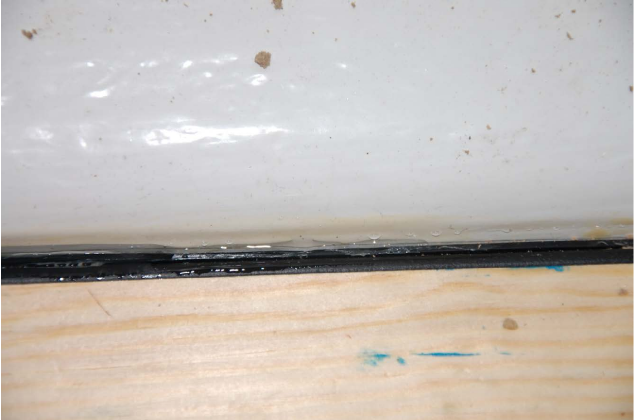
Figure 3.1: Water on seal of product demonstrating low leakage.