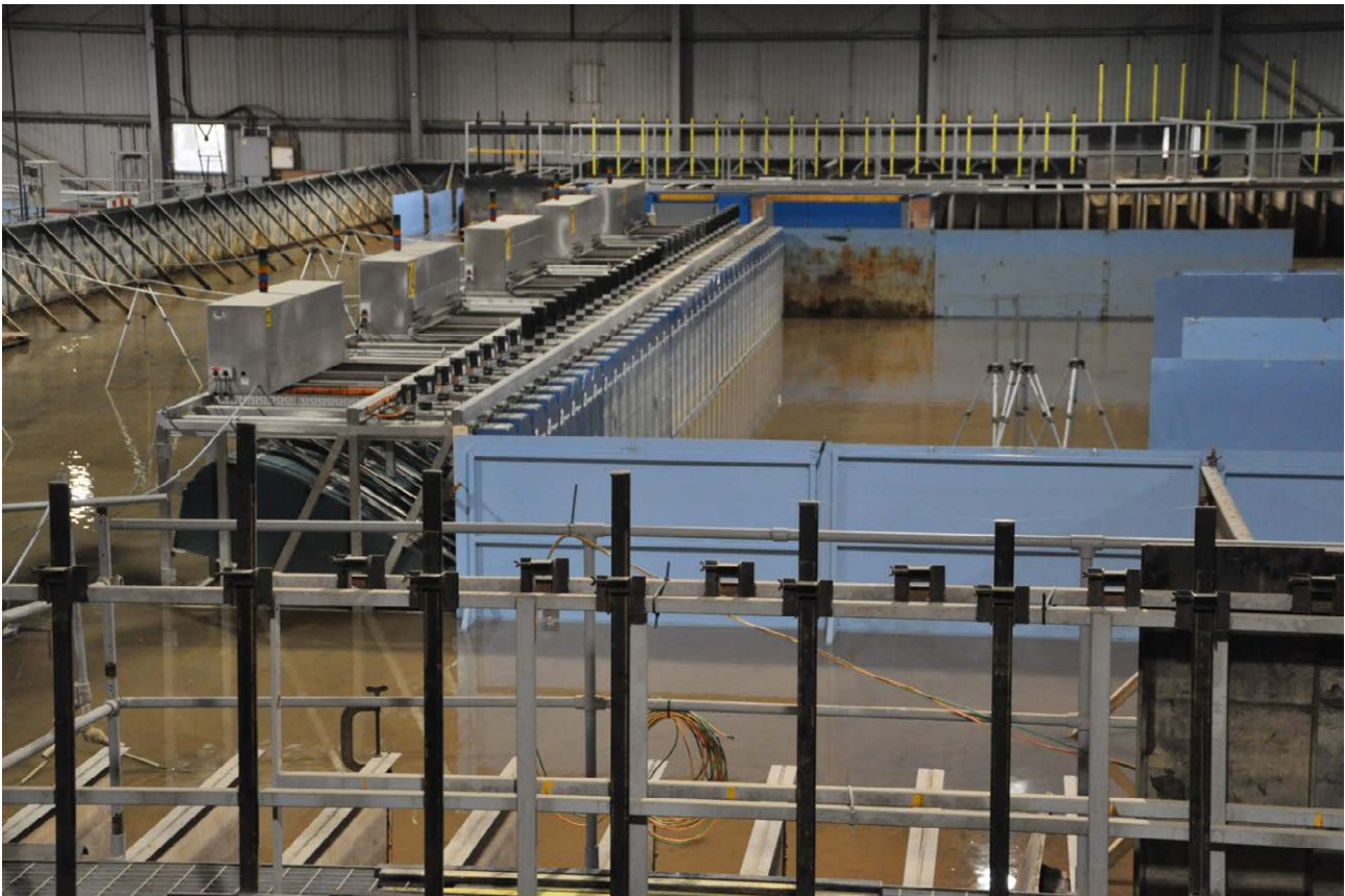
Figure 3.2: HR Wallingford wave generator.

Waves were measured by recording the average significant wave height at each of the four wave gauges, this was then adjusted using a reflection coefficient, calculated by the software, to generate the incident significant wave height.