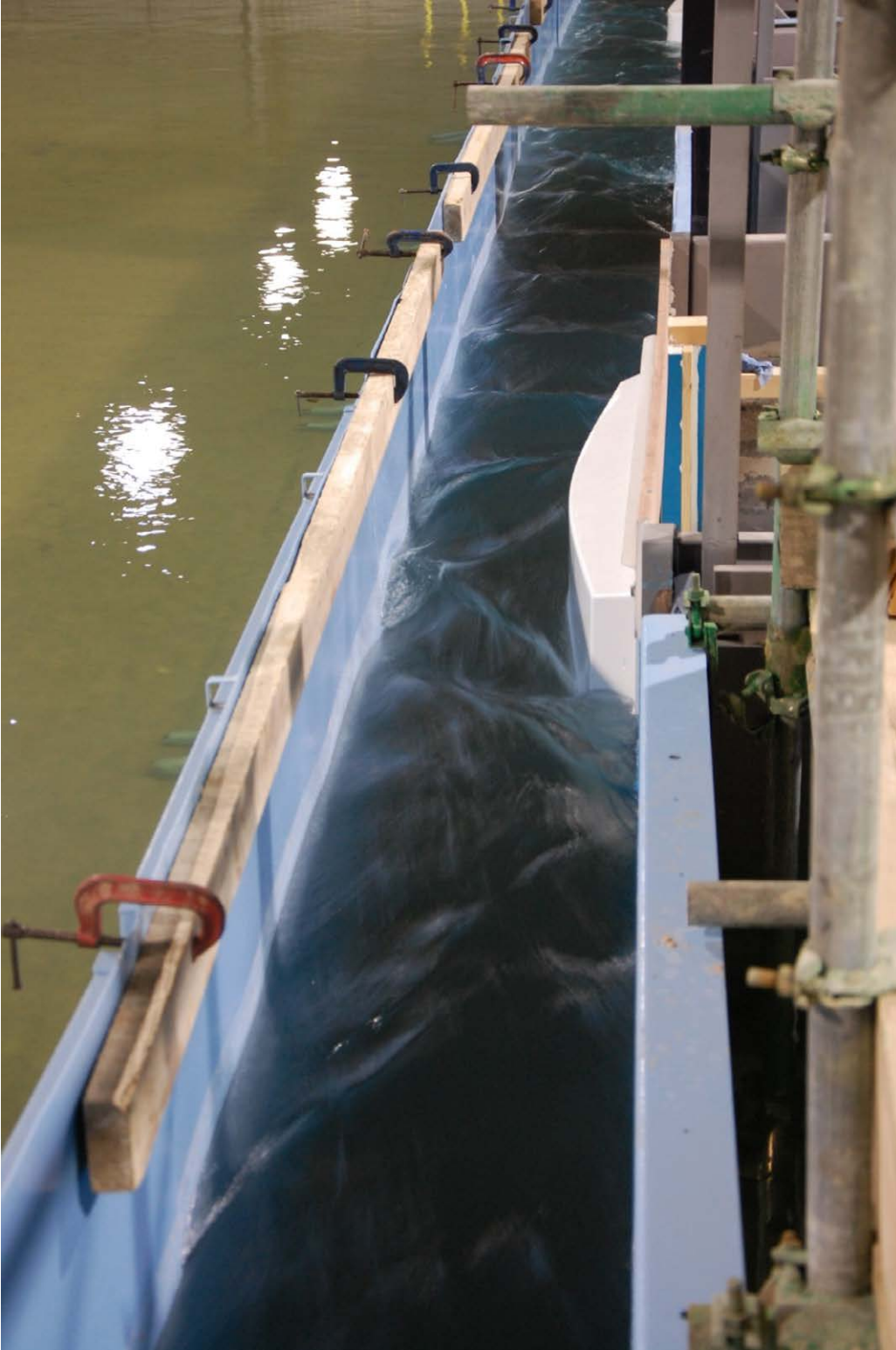
Figure 3.4: View downstream during current testing.