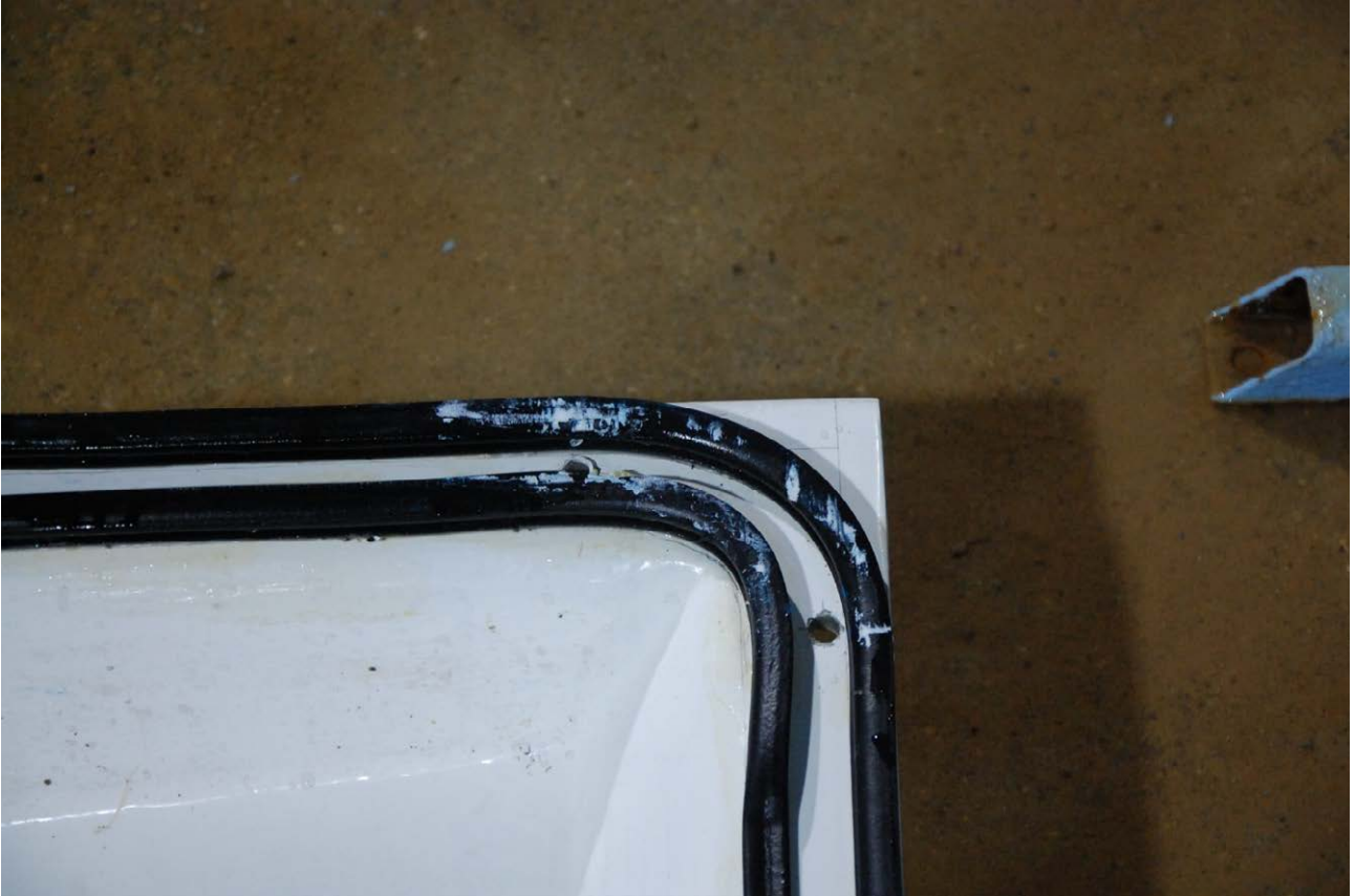
Figure 1.3: The dual seal used in Kayron's Large Flood product which is subsequently attached to a timber frame.